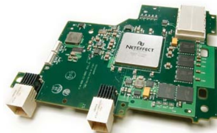
NetEffect NE020BCH high-speed expansion card (HSEC) form factor

The NE020BCH delivers bi-directional bandwidth of over 18 Gbps per port, in part, through a full implementation of the IETF-approved iWARP extensions to the TCP/IP standard. Each adapter integrates a TCP/IP